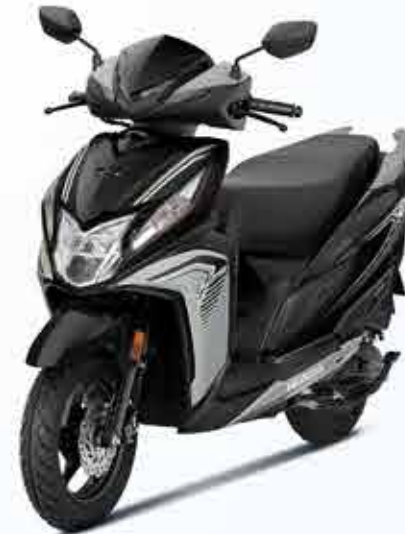
PEARL DEEP GROUND GRAY (STRIPE)