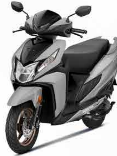
PEARL DEEP GROUND GRAY (EMBLEM)