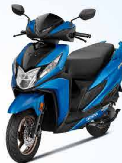
MAT MARVEL BLUE METALLIC